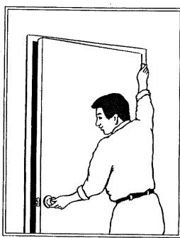
Open door a few inches past the binding point

INSTRUCTION: This tool is designed to adjust new, worn, or improperly adjusted Commercial Butt Hinges that cause the door to sag or drag. To fix the door slip the tool over the top door hinge and open the door. This action causes the door hinge to bind while the tool is in place.